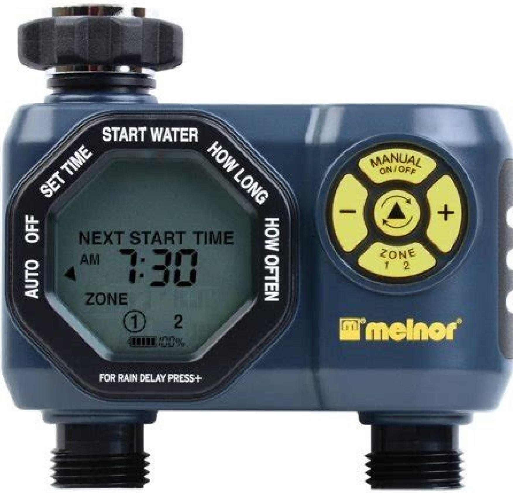
Melnor 3280. Melnor aqua timer manual. Melnor water timer 3280.